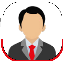
Precios Louzado Bahrain

The PCI-DSS training was awesome and well-delivered. The trainer explained everything clearly and kept the sessions engaging.